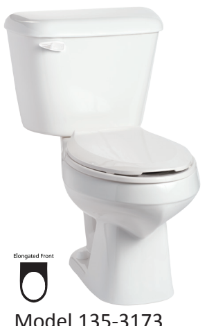
Model 135-3173 Toilet seat not included