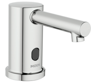
M•Power™ Align® Style Electronic Soap Dispenser