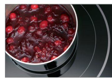
FLEX-2-FIT<sup>®</sup> HEATING ELEMENTS Automatically expands up to three sizes, giving you precision and control with a variety of cookware.