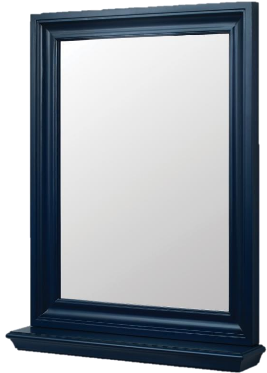
Royal Blue Pictured Above

**Please refer to the installation manual for cleaning instructions