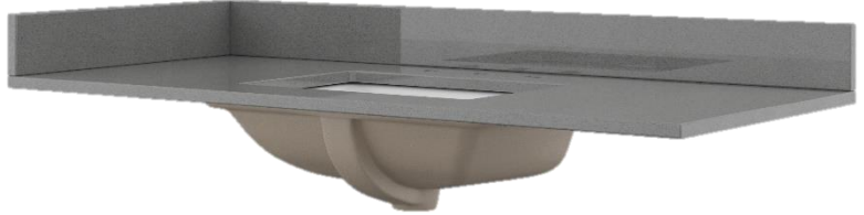
Galaxy Grey Quartz Pictured Above

**STONE CHARACTERISTICS: Natural stone exhibits variations in color, grain, and veining that are all part of their natural beauty. We apply a light sealer to our stone tops but natural stone is not impermeable. Clean all spills immediately. For more information see our care and cleaning instructions.