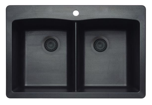
Model LX440220 shown in ANTHRACITE * basket strainer not included

LX440220 Double Bowl, 9-1/2" bowl depths, ANTHRACITE LX440218 Double Bowl, 9-1/2" bowl depths, CAFÉ BROWN LX440221 Double Bowl, 9-1/2" bowl depths, WHITE LX440222 Double Bowl, 9-1/2" bowl depths, BISCUIT LX440219 Double Bowl, 9-1/2" bowl depths, METALLIC GRAY LX442748 Double Bowl, 9-1/2" bowl depths, CONCRETE GRAY LX441285 Double Bowl, 9-1/2" bowl depths, TRUFFLE LX441466 Double Bowl, 9-1/2" bowl depths, CINDER