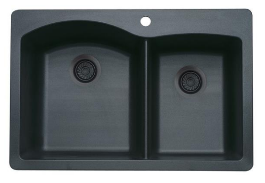
Model LX440215 shown in ANTHRACITE * basket strainer not included

LX440215 Double Bowl, 9-1/2" & 8" bowl depths, ANTHRACITE LX440213 Double Bowl, 9-1/2" & 8" bowl depths, CAFÉ BROWN LX440216 Double Bowl, 9-1/2" & 8" bowl depths, WHITE LX440217 Double Bowl, 9-1/2" & 8" bowl depths, BISCUIT LX440214 Double Bowl, 9-1/2" & 8" bowl depths, METALLIC GRAY LX442744 Double Bowl, 9-1/2" & 8" bowl depths, CONCRETE GRAY LX441283 Double Bowl, 9-1/2" & 8" bowl depths, TRUFFLE LX441465 Double Bowl, 9-1/2" & 8" bowl depths, CINDER