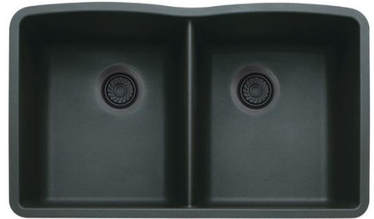
Model LX440184 shown in ANTHRACITE * basket strainer not included