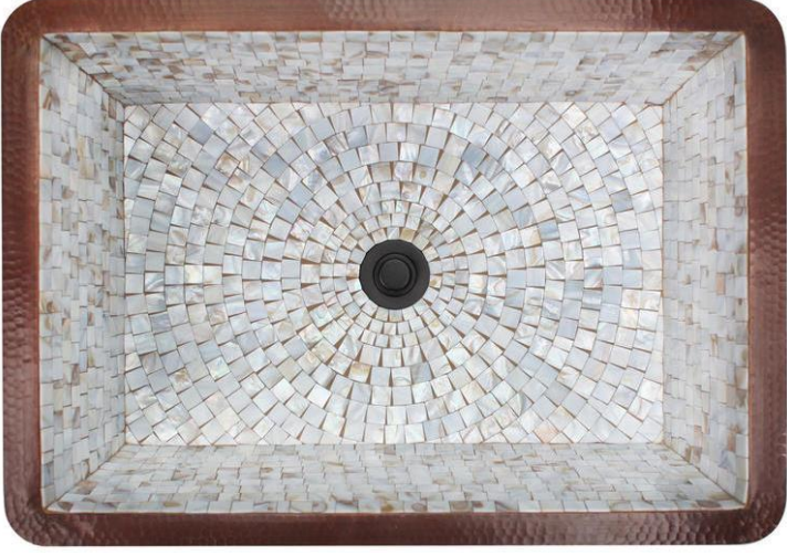
Showing a V018 WC-A-18-D005 DB