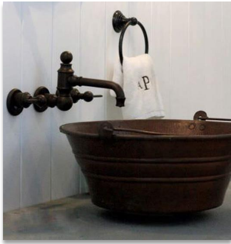
Shown in DB finish