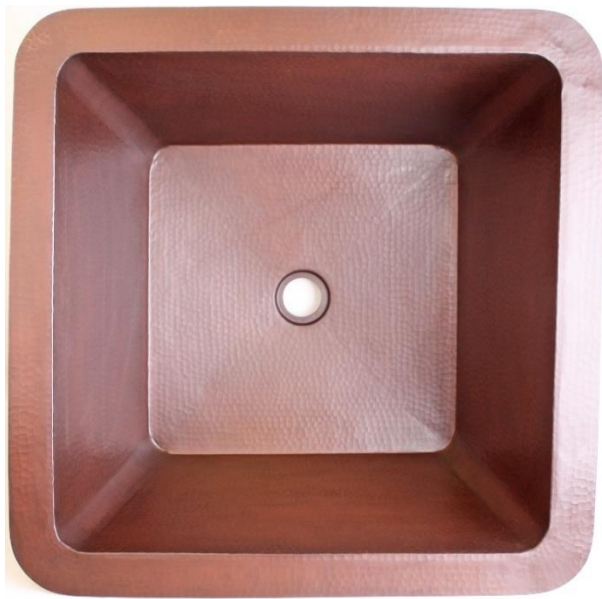
SHOWN IN WEATHERED COPPER