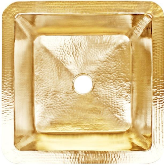
Shown in UB