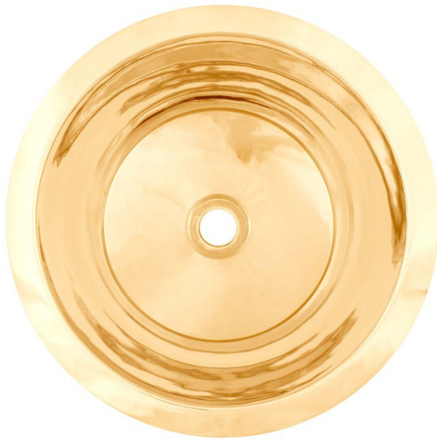
Shown in PB

Linkasink warranties our product to be free from manufacturing defect for the life of the product. Warranty does not cover improper care, neglect, abuse, or normal wear-and-tear.