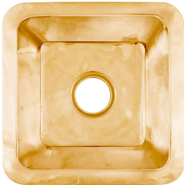
Shown in PB

Linkasink warranties our product to be free from manufacturing defect for the life of the product. Warranty does not cover improper care, neglect, abuse, or normal wear-and-tear.