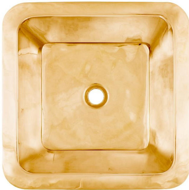
Shown in PB

Linkasink warranties our product to be free from manufacturing defect for the life of the product. Warranty does not cover improper care, neglect, abuse, or normal wear-and-tear.