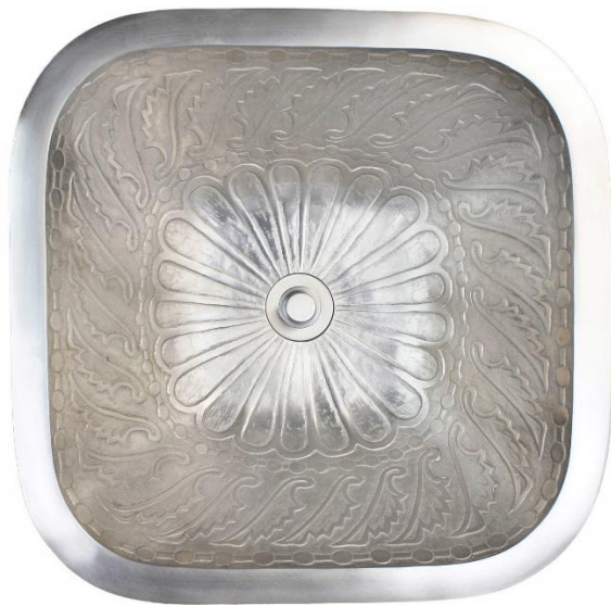
Shown in WB finish