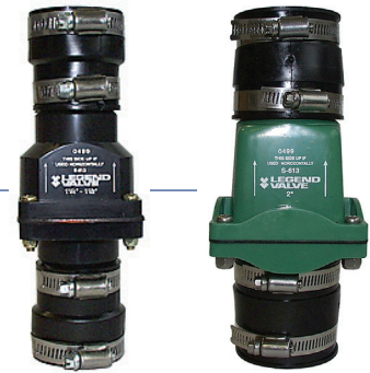
Pictured: 1 1/4" - 1 1/2" S-613

Not suitable for compressed air or steam service.