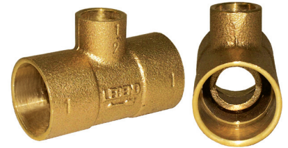
Pictured Model T-569