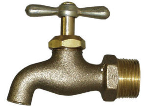
Pictured Model T-532