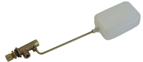
Pictured Model T-35

Cold working pressure (CWP): Saturated steam (WSP):