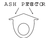
Pictured T-3205 Cut-away