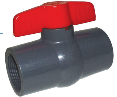
Pictured Model T/S-602 Cut-away

Cold working pressure (CWP): 150 PSI @ 73°F