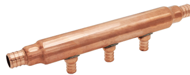
Pictured: PEX x PEX Multi-Port Tee