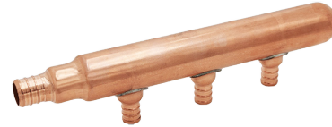
Pictured: PEX x Closed Multi-Port Tee

ASTM F2098: Metal or plastic insert fitting with a stainless steel clamp.