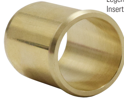
Pictured: LegendPress Bronze Insert Stiffener

Cold working pressure (CWP): 200 psi Saturated steam (WSP): 15 psi Operating temperature range: 0-250° F