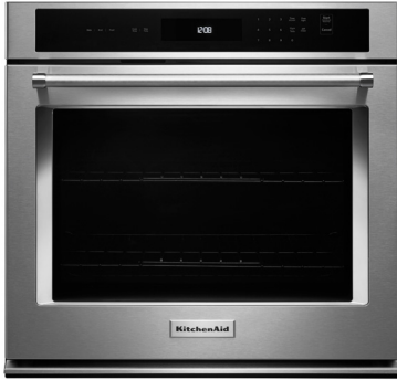
Stainless Steel KOST100ESS