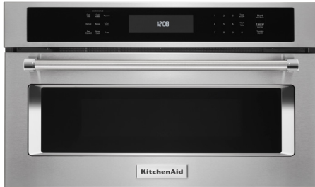
Stainless Steel KMBP100ESS