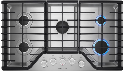
Stainless Steel KCGS356ESS