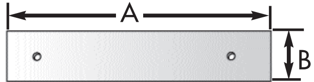
2 HOLE STUD GUARD