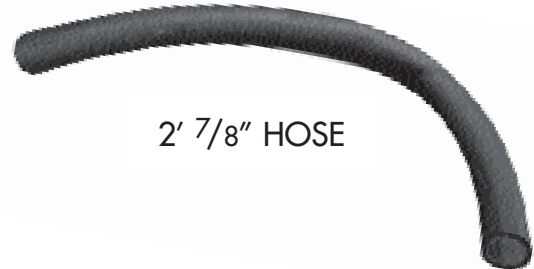
2' 7/8" HOSE