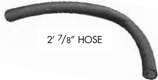
2' 7/8" HOSE