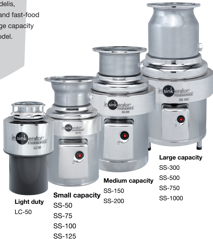
Light duty LC-50