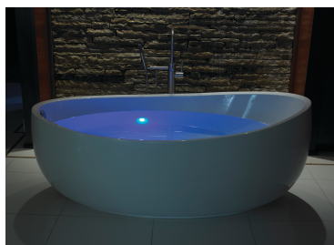
Chromatherapy-LED Lighting System