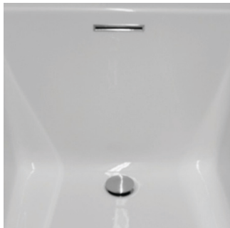
Linear Integral Waste and Overflow