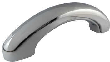
Standard Grab Bar