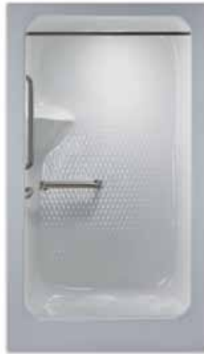
Photograph Illustrates Package One - Handed by Valve Wall Left

Due to the nature of the materials, dimensions may vary +/- 1/2".