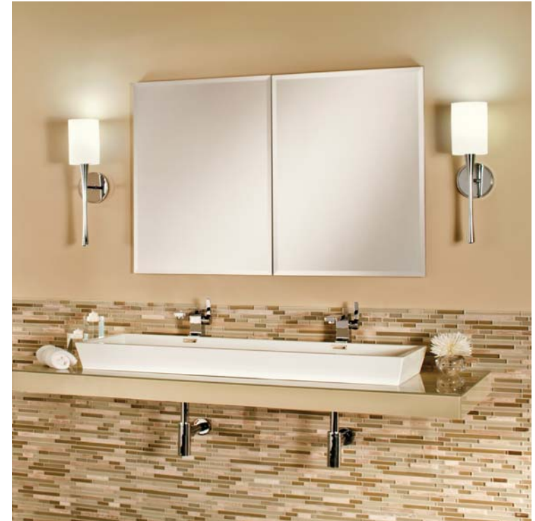
Beveled Mirror Section View