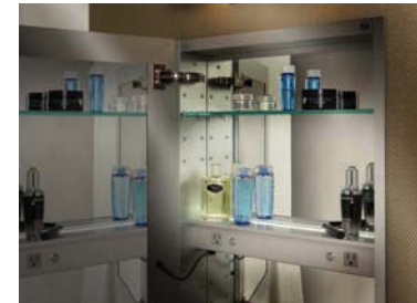
INTEGRAL LIGHT FEATURE