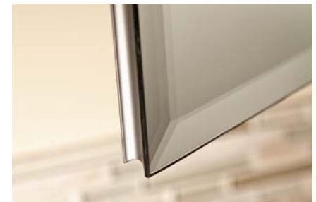
Beveled Mirror Section View