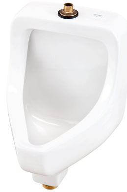
HE-27-740 Urinal Shown