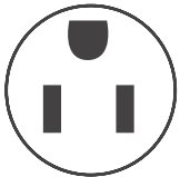
Plug Type (NEMA) 5-15P

1 Warranty 5 year sealed system/1 year full parts and labor.