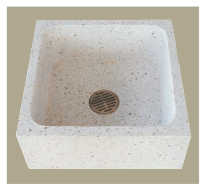
Shown: Model 5