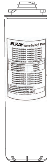
Replacement Model 51300C shown

This filter has been tested to the following NSF International standards: ANSI/NSF Standard 42 Chlorine-Class 1, Particulate-Class 1, and Taste and Odor. ANSI/NSF Standard 53 for Reduction of Lead.