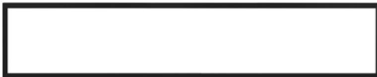
Compatible with the XLF74 (WxHxD): 76-3/4" x 18-1/4" x 1-7/8" (195.0 cm x 46.2 cm x 4.6 cm)