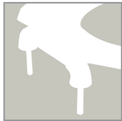
PLASTIC HINGES WITH STAINLESS STEEL POSTS AND PINTLES