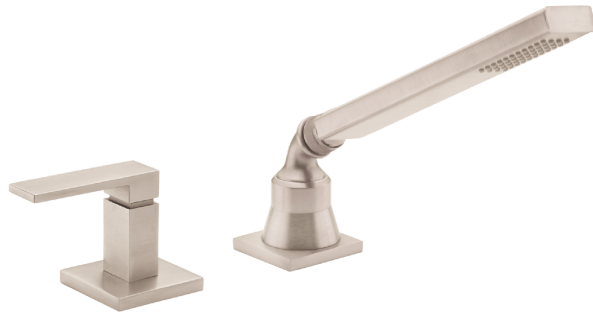
77.72.FR shown FR = Denotes flow rate