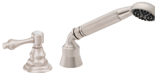
61.15.FR shown FR = Denotes flow rate