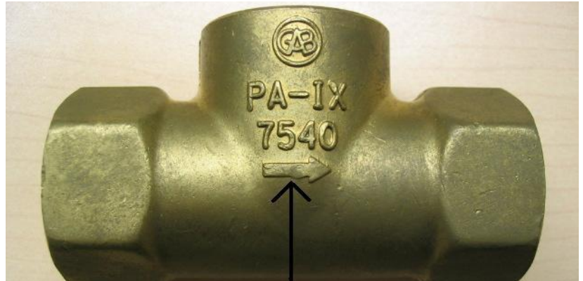
Photo 2 – shows the cartridge cavity for incoming and outgoing waterways.

This shows how water MUST be plumbed to valve body inlet and outlet ports. If this water flow direction is NOT followed the valve MUST be reinstalled.