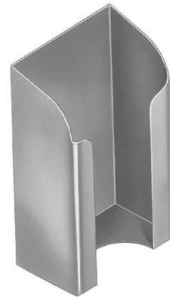
7/8" (22 mm) DIA. WALL OPENING