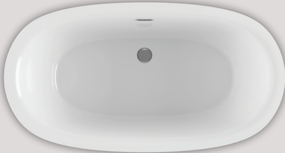
VIBE DESIGN 6033 (FREESTANDING)