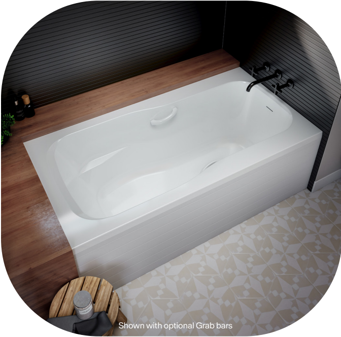
Shown with optional Grab bars