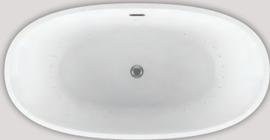
LIBRA AURORA 6634 (FREESTANDING)