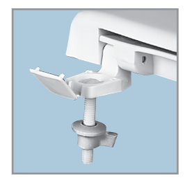
NON-CORROSIVE BOLTS AND WING NUTS